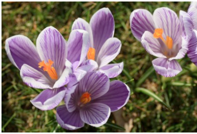
Small Spring Flowering Bulbs — 6 for £10!